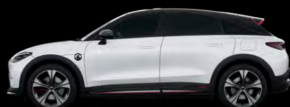
Digital White (Black Roof)