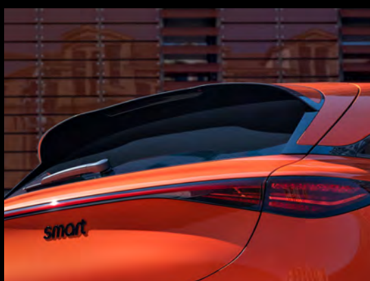
BRABUS spoiler aero package