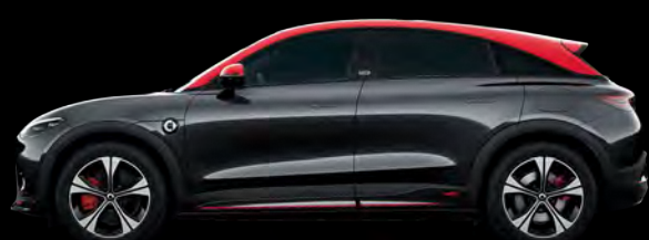
Meta Black (Red Roof)