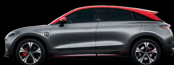
Atom Grey – Matte (Red Roof)