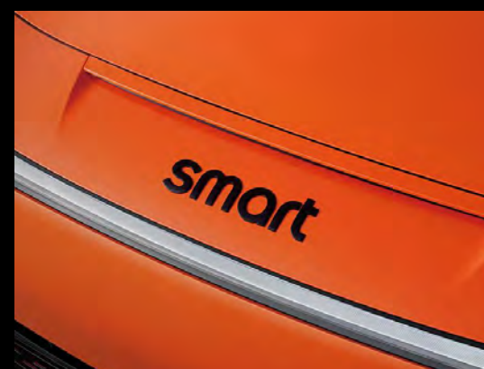
Sporty front hood with glossy black logo