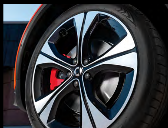
20" Synchro wheels and red brake calipers