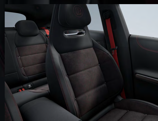
Microfiber Suede Seats

* Actual model, features and specifications may vary in detail from images shown. Subject to change without prior notice.