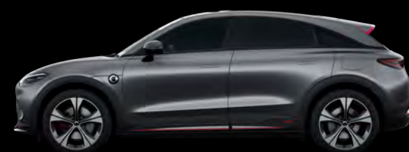
Atom Grey – Matte