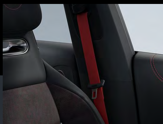
Red Sporty Seatbelt