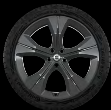
20" Synchro-245/40 R20

* Actual model, features and specifications may vary in detail from images shown. Subject to change without prior notice.