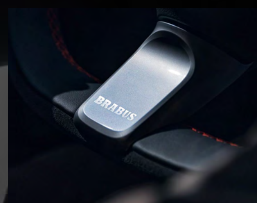
BRABUS Alcantara-wrap steering wheel