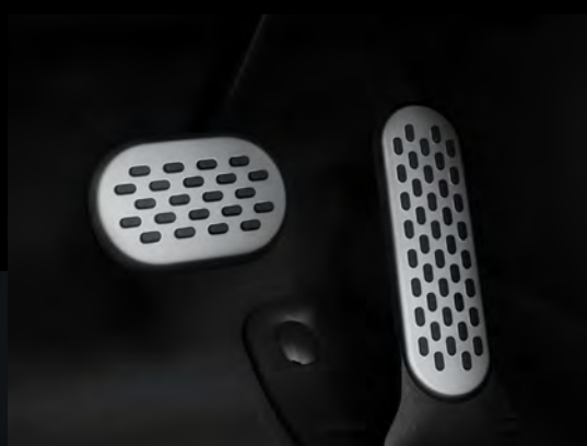
Aluminum Sport Pedals