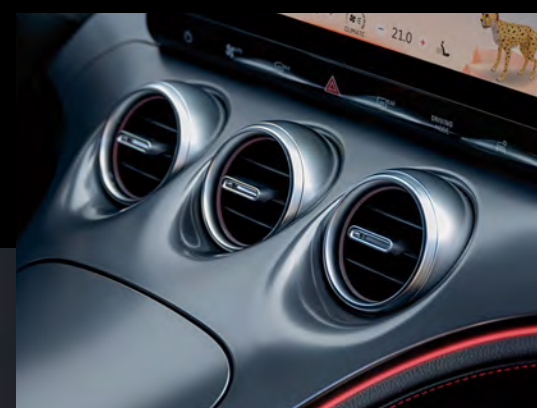
Turbine-style air vents