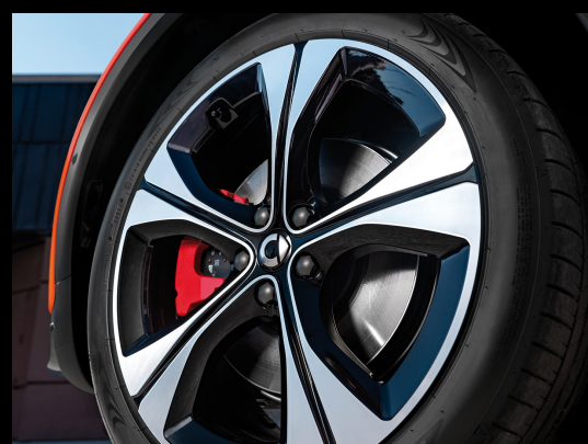
20" Synchro wheels and red brake calipers