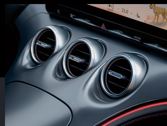
Turbine-style air vents