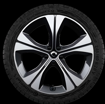
20" Synchro-245/40 R20

Actual model, features and specifications may vary in detail from images shown. Subject to change without prior notice.