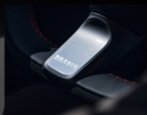
BRABUS Alcantara-wrap steering wheel