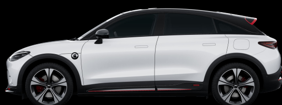
Digital White (Black Roof)