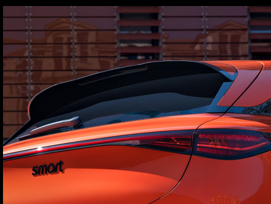
BRABUS spoiler aero package