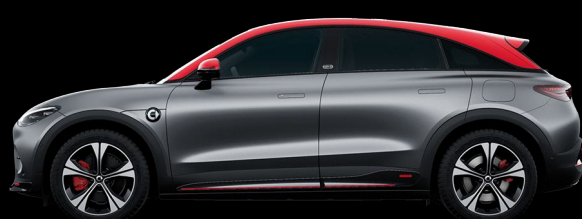
Atom Grey - Matte (Red Roof)