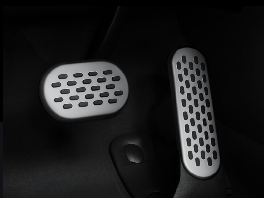
Aluminum Sport Pedals