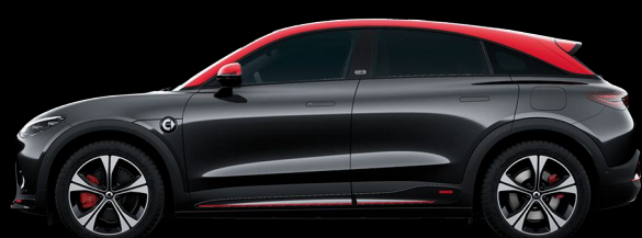
Meta Black (Red Roof)