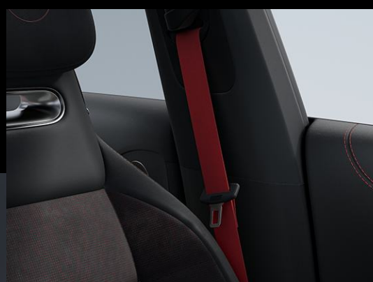
Red Sporty Seatbelt