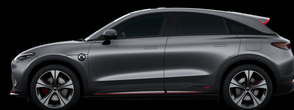
Atom Grey - Matte