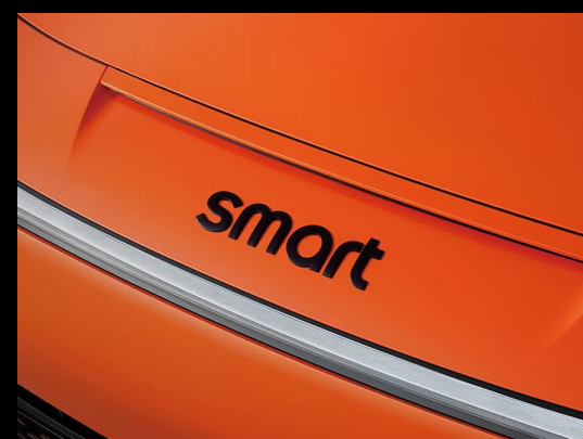
Sporty front hood with glossy black logo