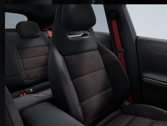
Microfiber Suede Seats

Actual model, features and specifications may vary in detail from images shown. Subject to change without prior notice.