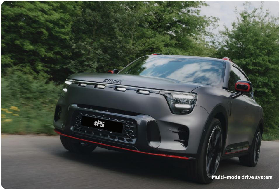
Multi-mode drive system

The smart #5 is ready for any adventure. Equipped with adaptive all-wheel drive and multiple driving modes, it seamlessly shifts from smooth highways to rugged trails. Whether it's exploring off-road paths or navigating the city, the smart #5 is always up for more.