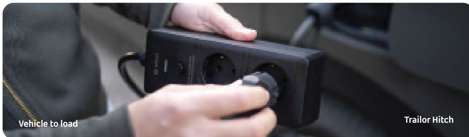
Vehicle to load